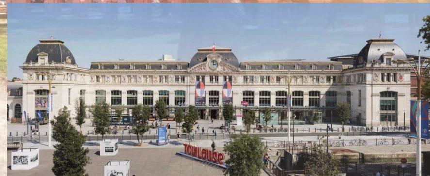
Toulouse Matabiau station